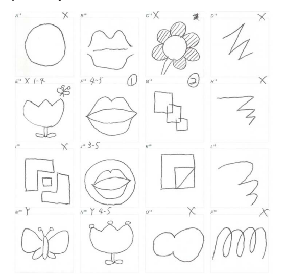
Figure 1. An example of a sheet, t = 18. X-marks on the upper-right corners indicate that the drawings were eliminated from the population by the subsequent participant. 1 (on F18) and 2 (on G18) indicate the drawings were chosen as the best, and the drawing was chosen as the second best, respectively.

The clean copy was subsequently handed to the next participant. This process was repeated for the total timesteps of forty-two times.