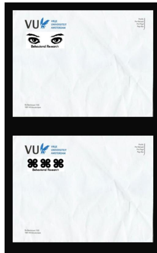
Figure 1. Example envelopes and stimuli used in the experiments.

Amsterdam on them and a caption 'Research Department' underneath the printed logos. The letters were addressed to Z. Manesi. Half of the envelopes ( n = 150 ) had printed eyes under the logo of the university and the other half ( n = 150 ) an image of flowers (control condition, Figure 1). The stimulus size was 1.80 x 5.10 cm and the envelope size was C5. The envelopes contained a neutral message, were prepaid and did not need a stamp. The inside of the envelope was coded with numbers (1 = high SES, 2 = low SES). We did not further differentiate among these 9 neighborhoods.